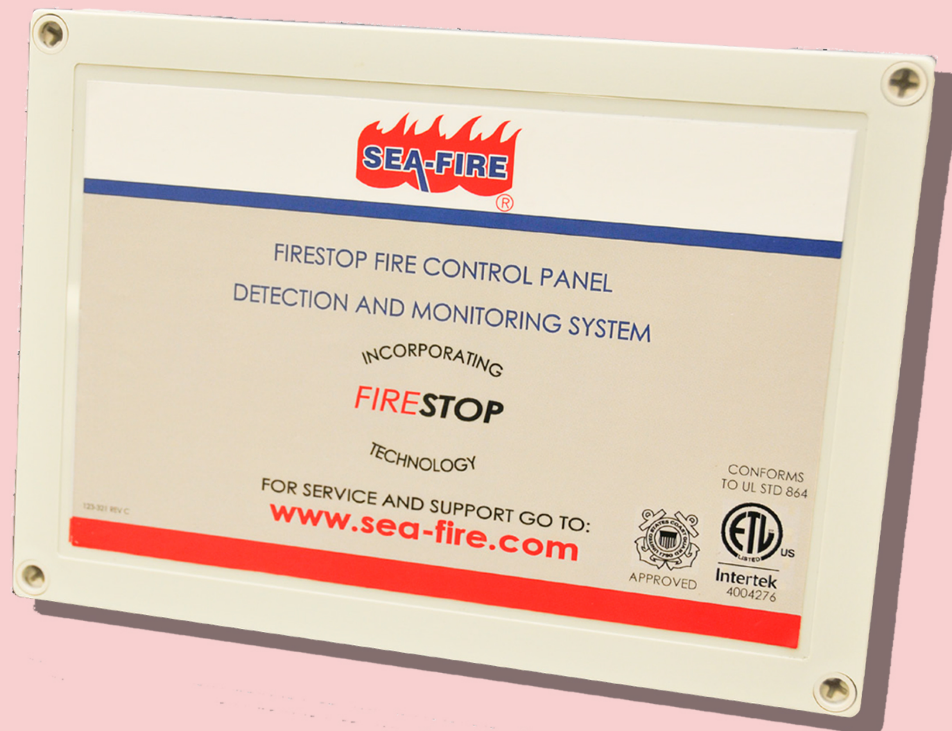
131-501 FireStop Fire Control Panel